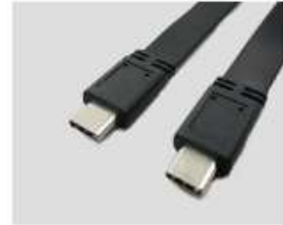
USB Type-C Male to Type-C Male Flat Cable